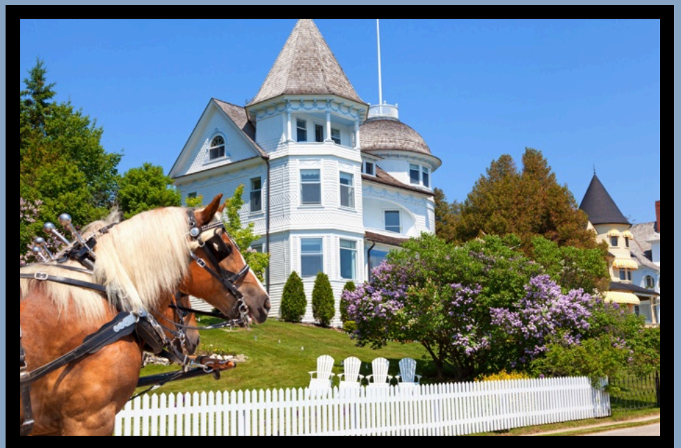
MACKINAC ISLAND, MICHIGAN

A picturesque island known for its well-preserved 19th-century charm, Mackinac Island is famous for its absence of motor vehicles, scenic views, and delicious fudge, making it a delightful getaway.